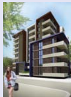
Artist's impression of social housing at the Elgin and Nicholson Streets site

The third stage of the project will include 112 social housing apartments and 116 private apartments. The design of the new housing buildings and the new public parks and playgrounds were reviewed by the Community